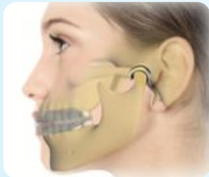
Immediate diagnosis and treatment of TMJ Disorder