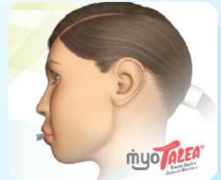
MRC's activities program and fast track for all age groups